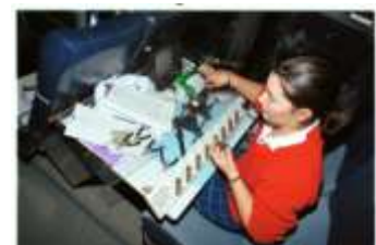
Secondary Students also study TAFE courses