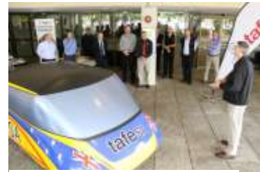
On show for sponsors