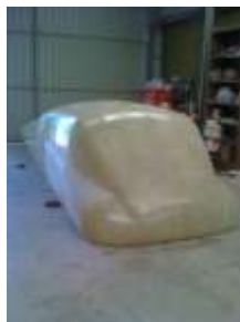
First test fibreglass shell

How – integrated to the education program A full time program based on both theory and practical at the Regency campus where students commence building small projects and transition into various build aspects of Solar Spirit