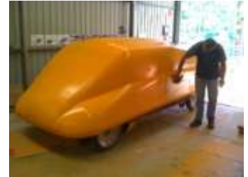
Buffing the test shell

Students working in composites on the solar car project late last year have been employed and are returning to Regency as apprentices