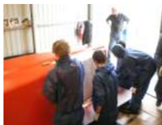
Mech Eng students making moulds

The project team is very much aware of the principles of sustainability. In keeping with these principles we are re-using, reducing and recycling components from our two previous vehicle (Kelly and SolarSpirit prototype) in the construction of SolarSpirit. While we have had no direct involvement with schools' solar teams, we will be donating our excess components to these teams to assist in the construction of their vehicles. For example we are most pleased to be donating the entire top shell of Kelly to Energy Education Australia. This will give them the ability to build up their array and provide enriched educational experiences for secondary students.