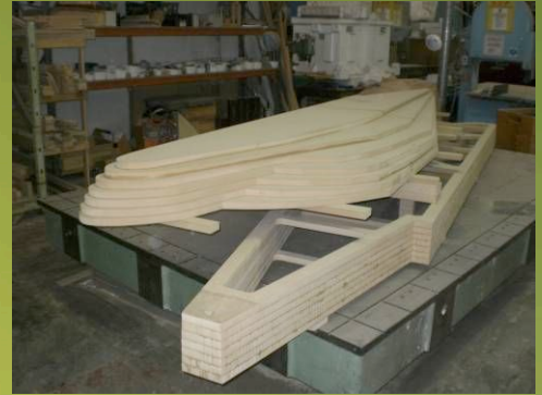
Frames for plug made at Hightech

Further information is available at solarspiritaustralia.com