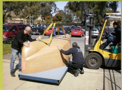
The plug arrives at Regency campus